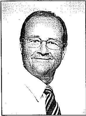
Duane Frey Elementary School Principal