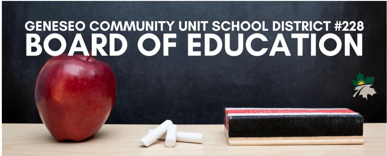
Graphic that will be used on the GeneseoSchools.org home page for BOE agendas: