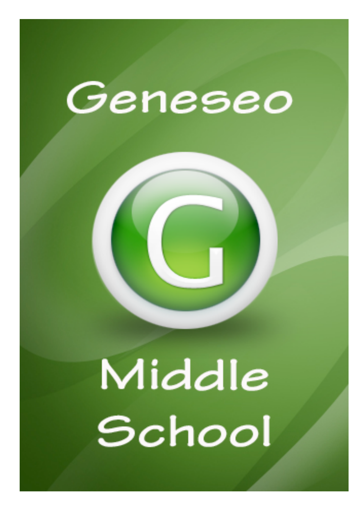
2015/2016 Student Handbook