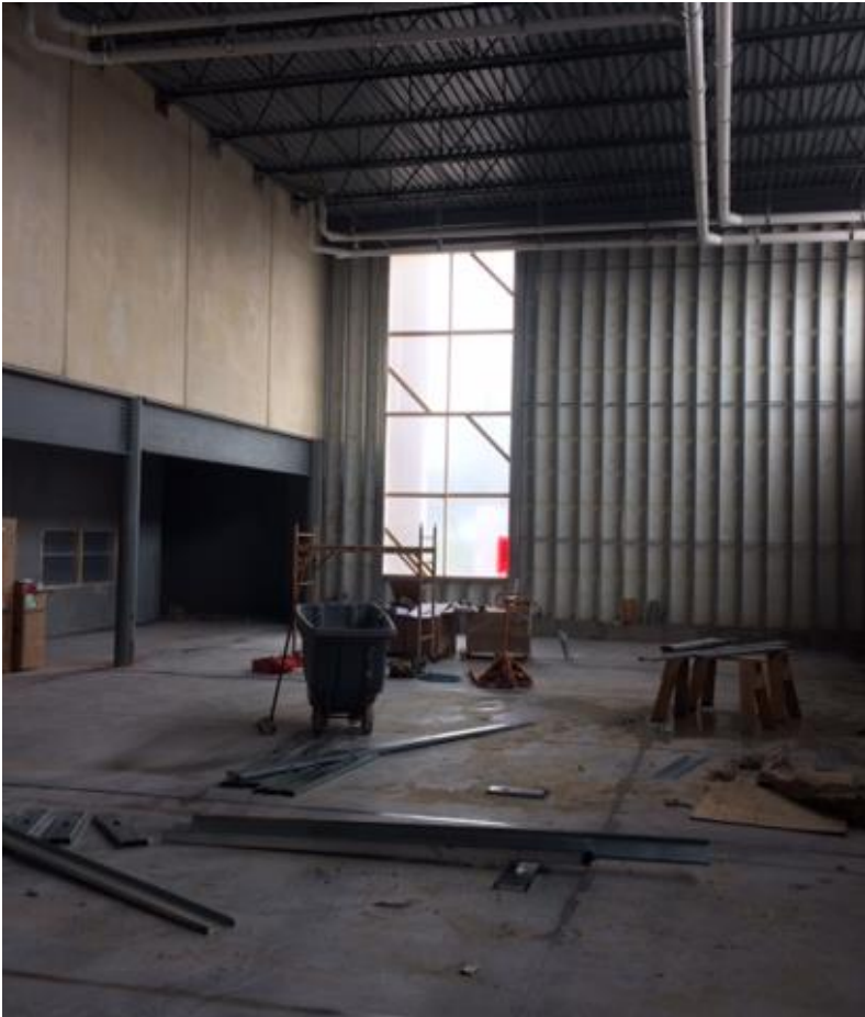
Floor poured in new Collaboration Area and Corridor A112. New walls and MEP ceiling rough-ins to follow. 4.3.17