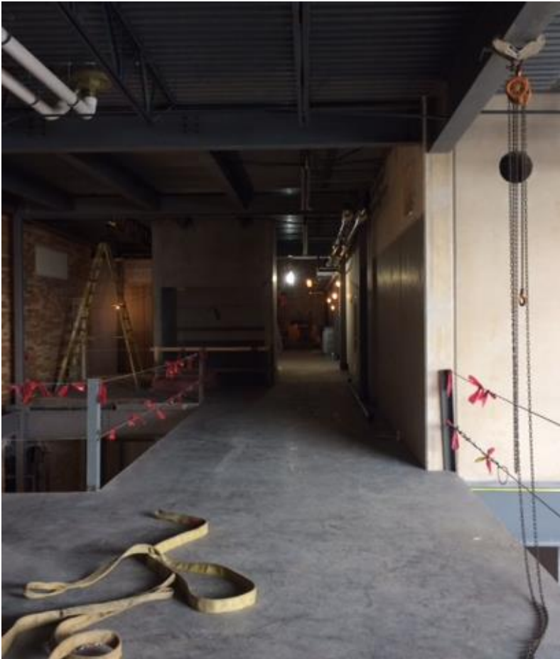
Entire second floor of new addition poured. 4.3.17