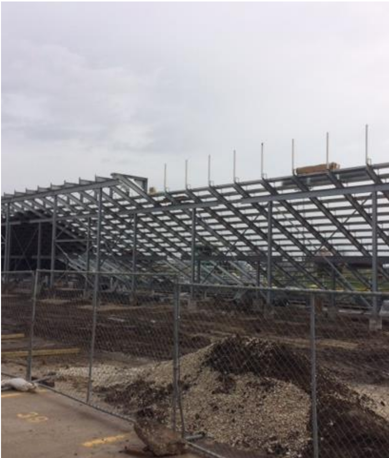
New home side bleachers will soon be completed. Storage shed and site concrete will follow.