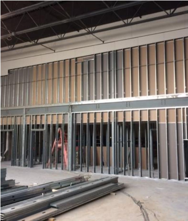
New Concert Band/Marching Band Rooms progress: studs installed at center area, storage rooms, and second floor mechanical room. Drywall installation underway.