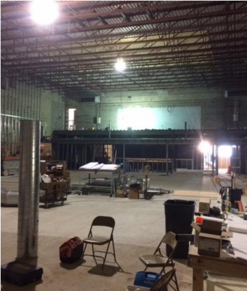
Old Auditorium/New Drama Theater progress: second story steel deck erected, back rooms laid out and studs installed, new HVAC work soon to commence.