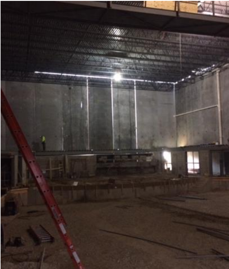
New Concert Hall progress: final precast panels installed on south wall, floors being prepared for concrete, block wall currently being erected on south end.