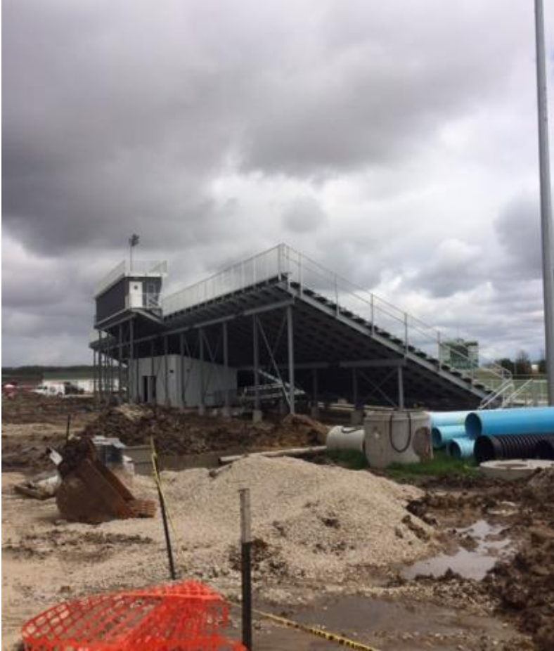
New bleachers erected and press box installed. Only punch list items remain before turning over to owner.