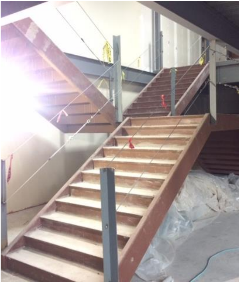
Stairs installed and poured on east side of Lobby/Collaboration A102 allowing for 2 nd floor access.