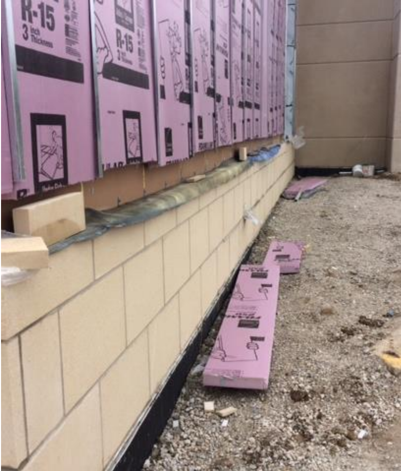
Exterior finish work underway on west side of new addition along State St. This is the stone veneer "skirt" which will run the length of the precast walls which aren't finished and along some areas of the existing school.