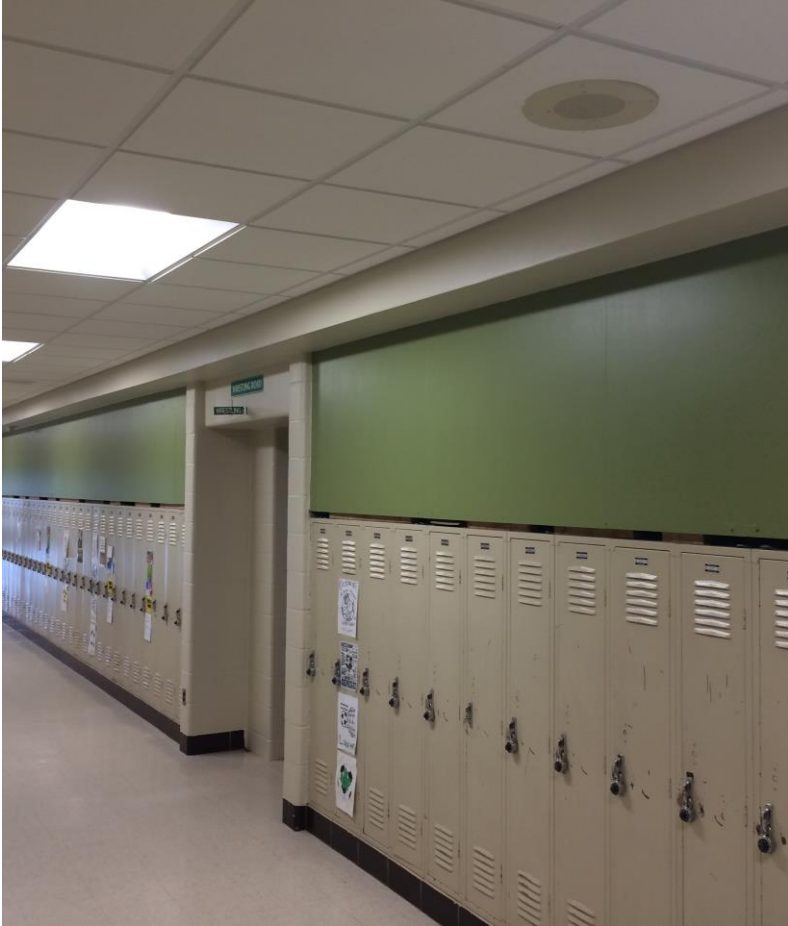
Work completed in Corridor B133 over Spring Break; however, lockers have not been replaced yet. New ceiling tile and grid, paint, and new lights.