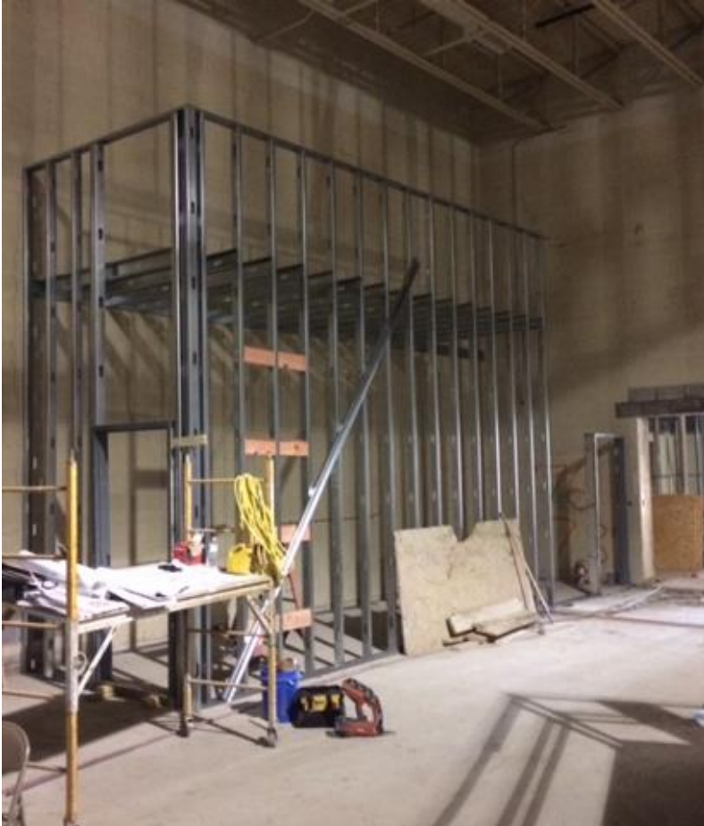
Interior studs and drywall underway in new addition along with existing auditorium. This picture displays the beginning stages of the new backstage Makeup/Dressing Room Area in the new Drama Theater.