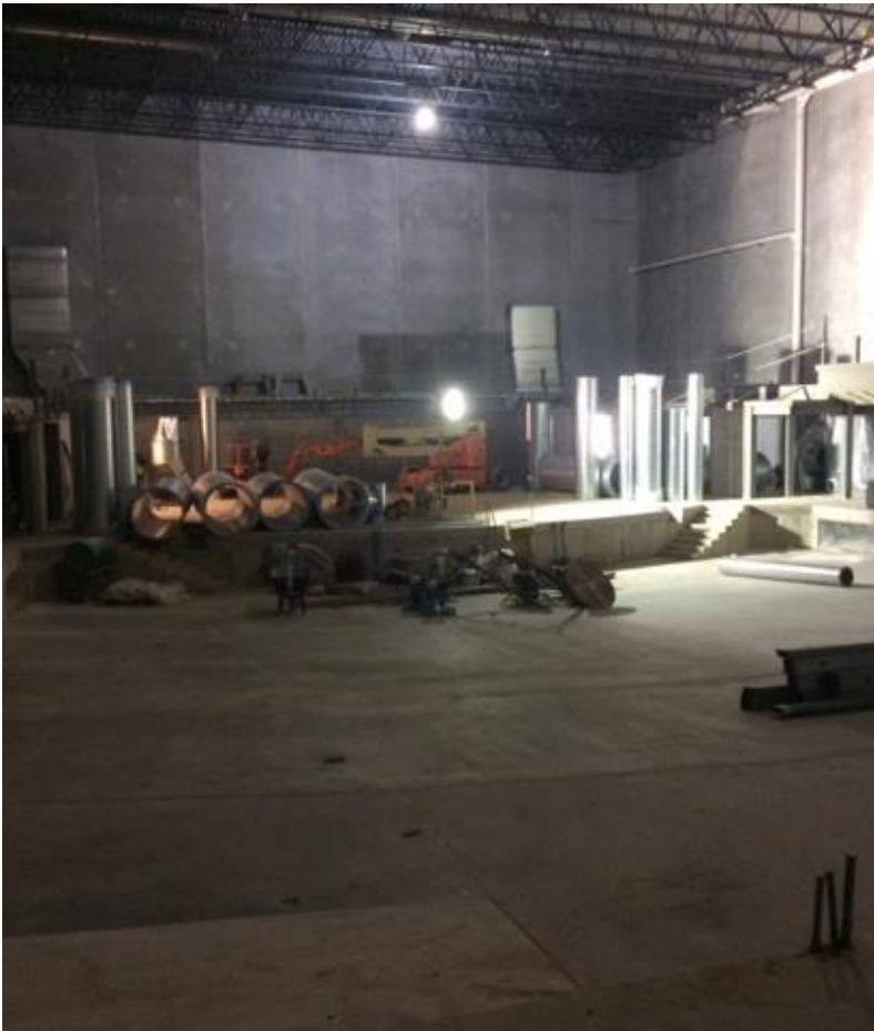
Last of the interior slabs being poured on the 2 nd deck of the new Concert Hall. Mechanical and Electrical rough-ins continuing.